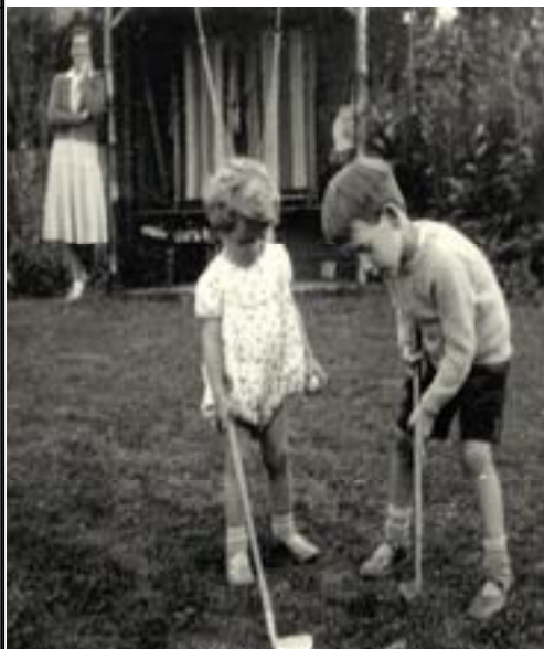
Who is this budding GINS golfer on the left? (Now plays mostly at Los Moriscos)

(THE PRETTY ONE ON THE LEFT) NOW PLAYS MOSTLY AT LOS MOS